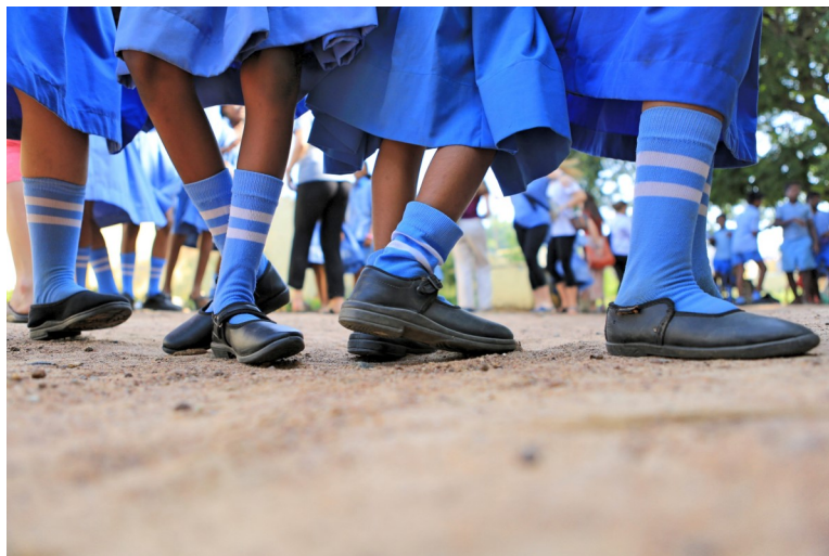
Yiming Hu \ India

Sexual and other forms of harassment and crime can happen anywhere, at any time, but are more likely when the victim feels disoriented or insecure; individuals are typically less confident when traveling abroad. To best avoid being a victim, always be aware of your surroundings. This includes knowing where the nearest police station and hospital are. Familiarize yourself local cultural customs to empower yourself to feel more confident in your environment.