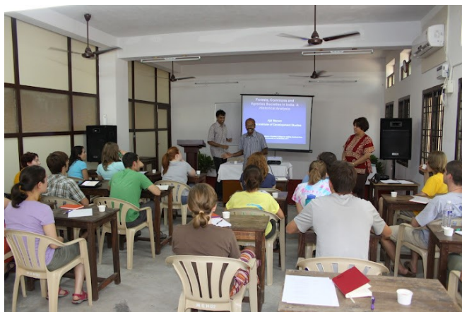
Furman in India

This handbook is intended only to serve as an introduction to study away procedures and to answer frequently asked questions. Consult the Registrar's Office or Academic Dean's Office for official academic regulations pertaining to study away or Furman University Policies and Procedures Section 112.6, Study Away Program Administration, for official university policies.