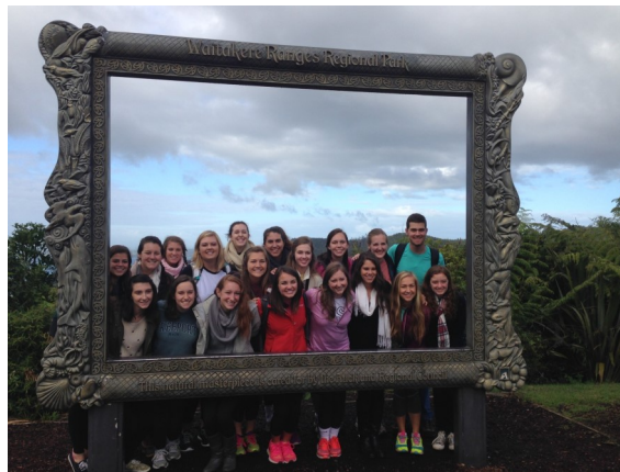
Furman in New Zealand

Before leaving your destination university, inquire about and fulfill the steps to request a transcript of any coursework you've completed through a university other than Furman. Course transfers, as applicable, will be coordinated between Furman and the credit-granting institution, but it will be important that you have a personal copy of the transcript for your own records, and any future graduate or professional school applications.