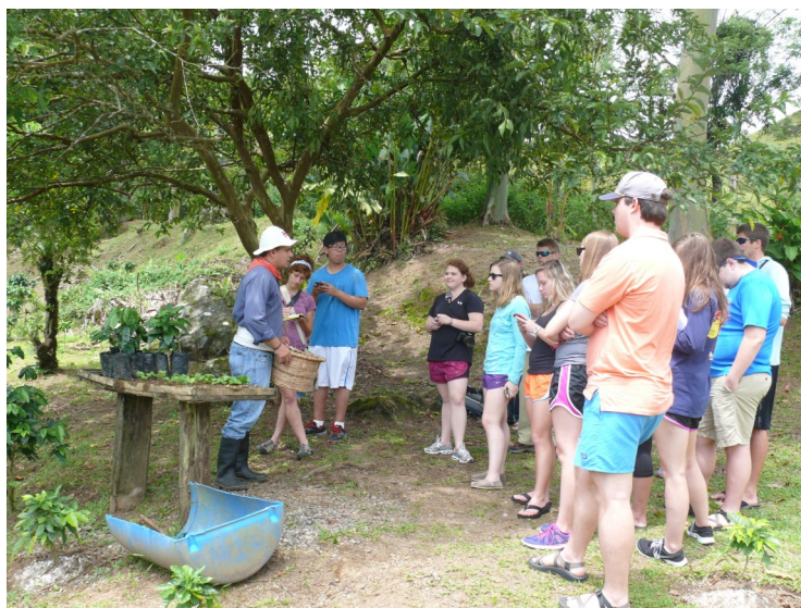
Study Away in Costa Rica

All credits and grades earned from courses taught by a Furman faculty member on a faculty-led study away program are granted on the same basis as those earned on campus and grades for these courses are factored into the Furman GPA. Furman courses that carry GER credit or that count towards a concentration or a departmental major will be designated in the course catalog.