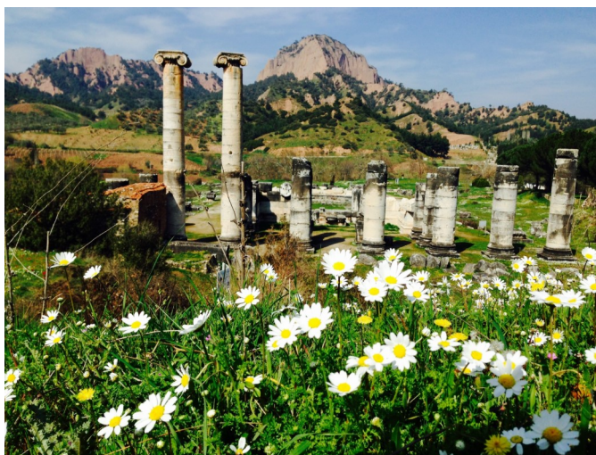
Blake Shelton \ Greece

Students will apply through the online study away application system. Most programs ask students to identify how they will contribute to and benefit from the academic focus of the specific study away program and how they are prepared to engage in the study away experience. Because programs are competitive, students should treat the application with the same seriousness they would a job application. Most programs also interview selected applicants. The faculty who are directing the study away program or coordinating the affiliates and exchanges will review the applications.