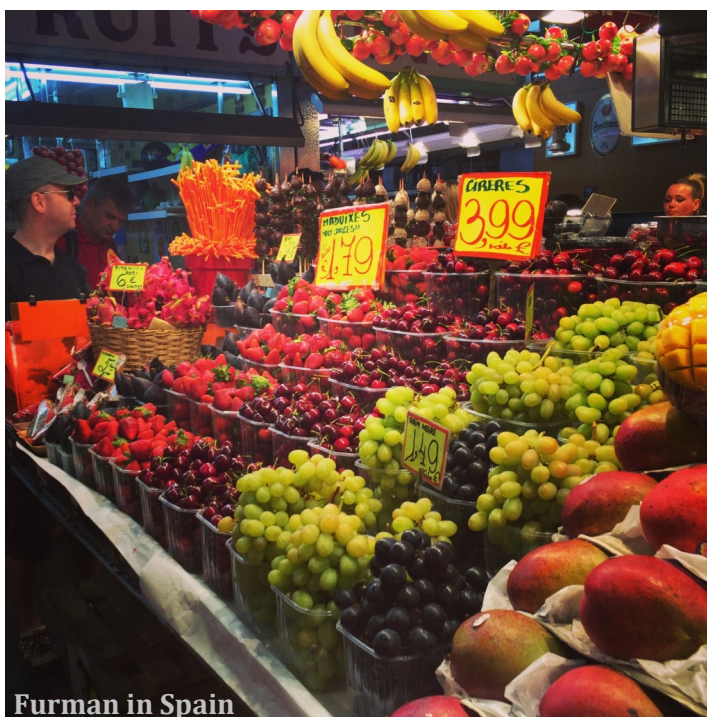
Furman in Spain

You must notify your bank or credit card company of your travel plans . Otherwise they might disable your card after your first charge abroad, thinking that it may be a fraudulent charge. Most European credit cards have a built-in chip card and require a pin code. If your credit card does not have a chip and a pin, it may not be accepted in Europe.