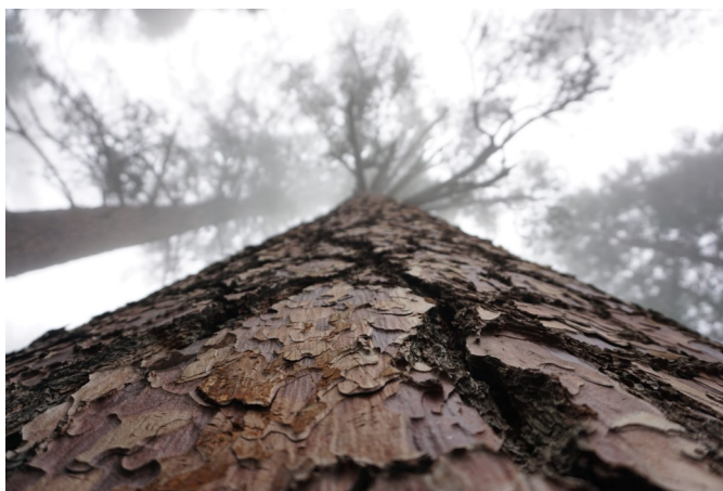
Emily Kern \ United States

If you are participating in a Furman faculty-led program that travels partially or entirely within the U.S., you are required to have U.S.-based personal health insurance, at your own expense, for the duration of the program. Please check with your personal insurance provider to ensure that you have adequate coverage for your program activities. You will be required to submit proof of insurance using the online application system prior to your departure.