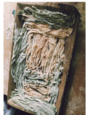
Delaney Fleming / Slow Food