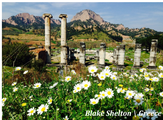
Blake Shelton \ Greece

Students who wish to pursue a non-Furman program will need to make an advising appointment with a staff member in the Rinker Center for Study Away and International Education. Students should first research programs using some of the non-Furman program resources listed earlier in this handbook. Once a program is identified, students will work directly with the external university or provider to apply and to prepare for the program. Some applications to non-Furman programs require the endorsement of a Furman university official or a review of the student's academic and disciplinary records. Contact Furman's Study Away Coordinator for this approval.