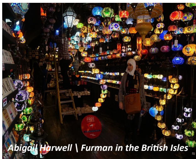
Abigail Harwell \ Furman in the British Isles

Students will apply through the online study away application system. Most programs ask students to identify how they will contribute to and benefit from the academic focus of the specific study away program and how they are prepared to engage in the study away experience. Because programs are competitive, students should treat the application with the same seriousness they would a job application.