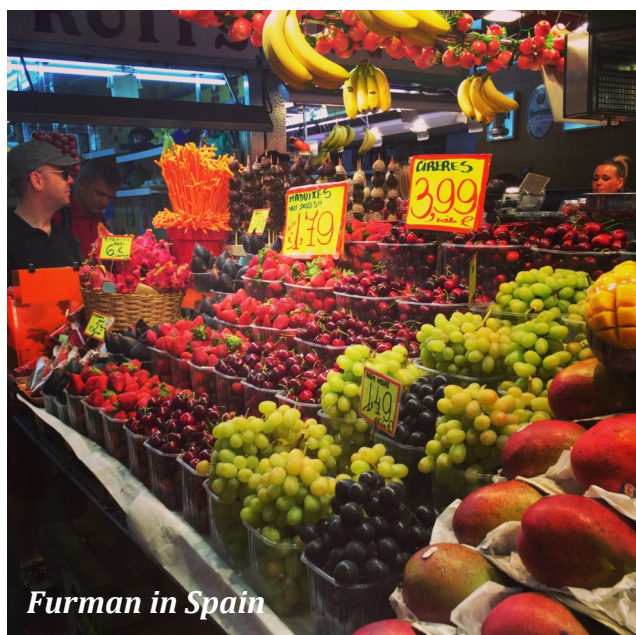
Furman in Spain

You must notify your bank or credit card company of your travel plans . Otherwise they might disable your card after your first charge abroad, thinking that it may be a fraudulent charge. Most European credit cards have a built-in chip card and require a pin code. If your credit card does not have a chip and a pin, it may not be accepted in Europe.