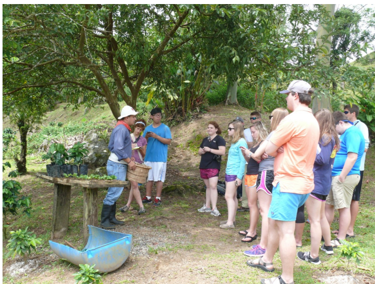
Study Away in Costa Rica

All credits and grades earned from courses taught by a Furman faculty member on a faculty-led study away program are granted on the same basis as those earned on campus. Grades for these courses are factored into the Furman GPA. Furman courses that carry GER credit or that count towards a concentration or a departmental major will be designated in the course catalog.