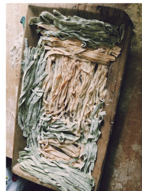
Delaney Fleming / Slow Food