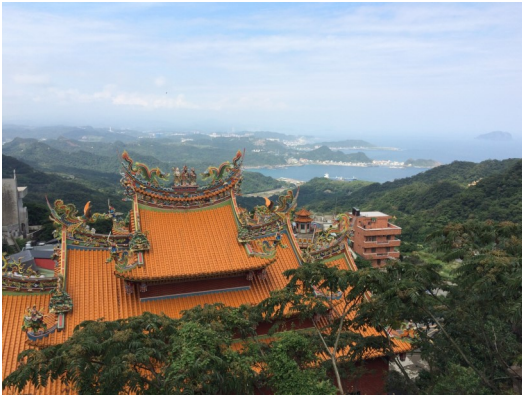
Kirby Funt \ Furman in China