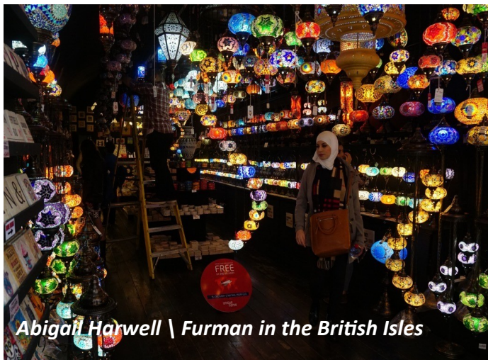
Abigail Harwell \ Furman in the British Isles

Students will apply through the online study away application system. Most programs ask students to identify how they will contribute to and benefit from the academic focus of the specific study away program and how they are prepared to engage in the study away experience. Because programs are competitive, students should treat the application with the same seriousness they would a job application.