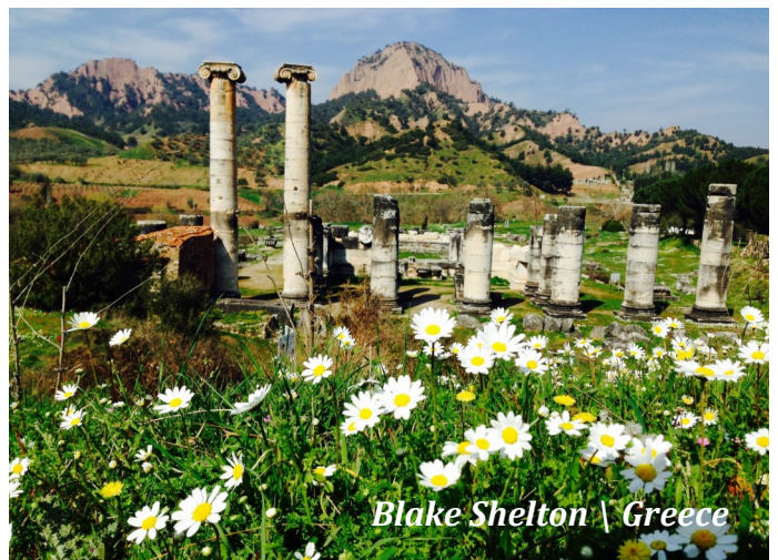
Blake Shelton \ Greece